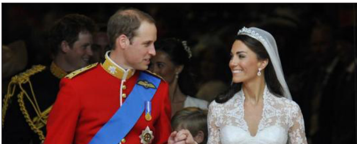
Britain's Prince William and Catherine, Duchess of Cambridge, look at one another after their wedding ceremony in Westminster Abbey