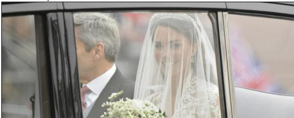
Kate Middleton and her father, Michael, travel in a Rolls Royce to Westminster Abbey in central London

Prince William and Kate Middleton tied the knot at Westminster Abbey on Friday April 29 th , 2011, in an event that capture the attention of the world.